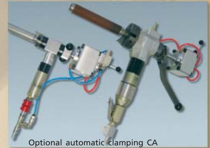
Optional automatic clamping CA